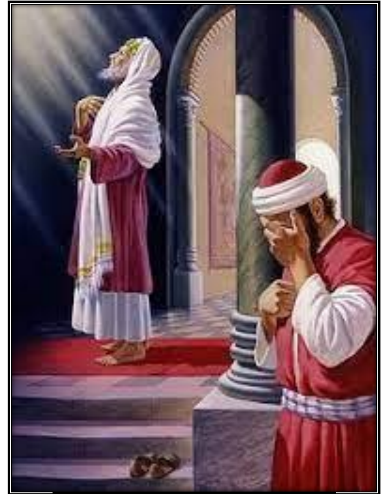
Parable of the Pharisee and the Tax Collector

*Includes $2,290 PPP from Armstrong Co. and 2 nd PP of $9,195